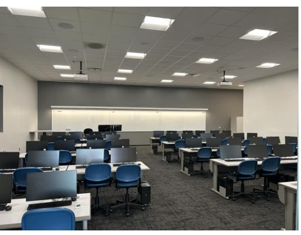
GLASS 263 (HID) Bailey Interior Design Studio

Move 100+ computers from PCOB to Glass Hall Installed over 400 computers in Glass Hall and Kemper Hall