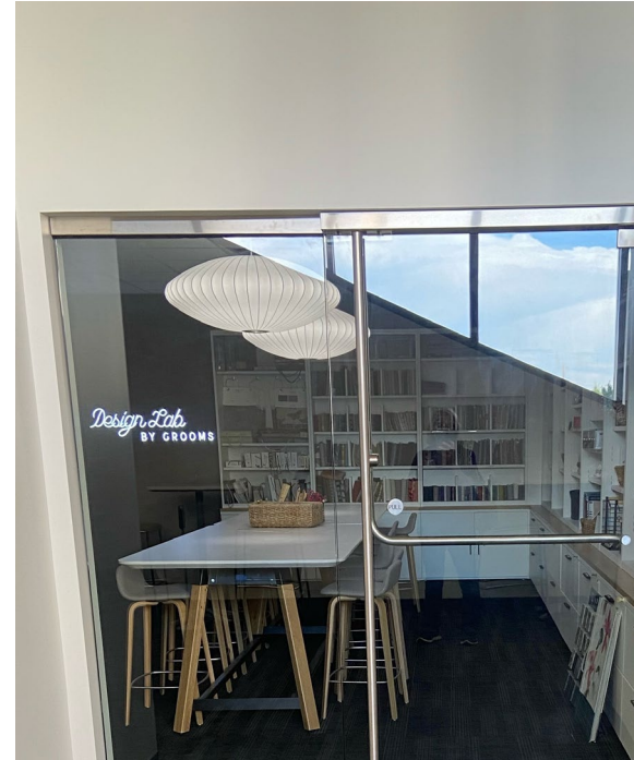
Glass 231 Glass Entry