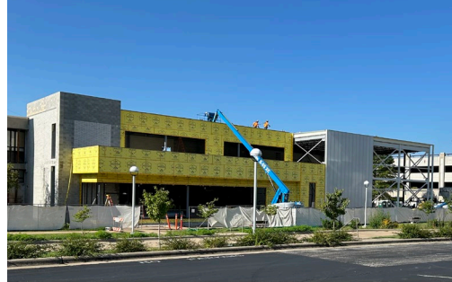
August 16, 2024