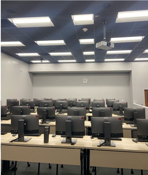
Glass 226 LED Lighting